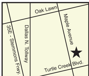
Heritage World Headquarters

THIS AUCTION IS PRESENTED AND CATALOGED BY HERITAGE NUMISMATIC AUCTIONS, INC.