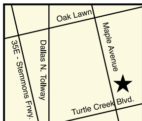
Heritage World Headquarters

THIS AUCTION IS PRESENTED AND CATALOGED BY HERITAGE NUMISMATIC AUCTIONS, INC.