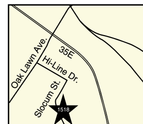
Heritage Design District Annex

Headquarters • 3500 Maple Avenue, 17th Floor • Dallas, TX 75219 Design District Annex • 1518 Slocum Street • Dallas, TX 75207 Beverly Hills Office • 9478 W. Olympic Blvd., First Floor • Beverly Hills, CA 90212 214.528.3500 | 800.872.6467 | 214.409.1425 (fax) Direct Client Service Line: Toll Free 1.866.835.3243 • Email: Bid@HA.com